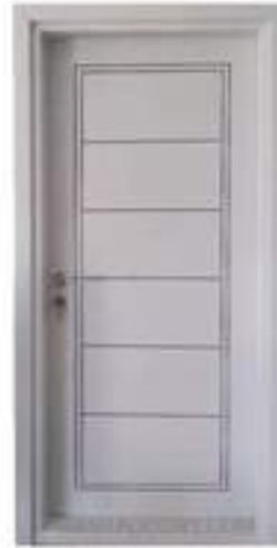
ABS Door cover