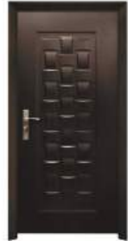
HPL Door cover