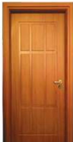
PVC door cover