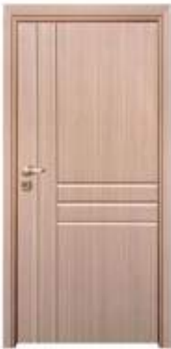
Wooden door cover